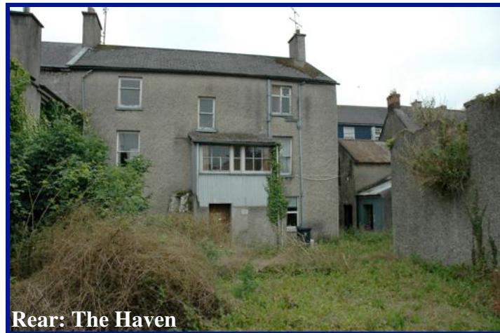
Rear: The Haven