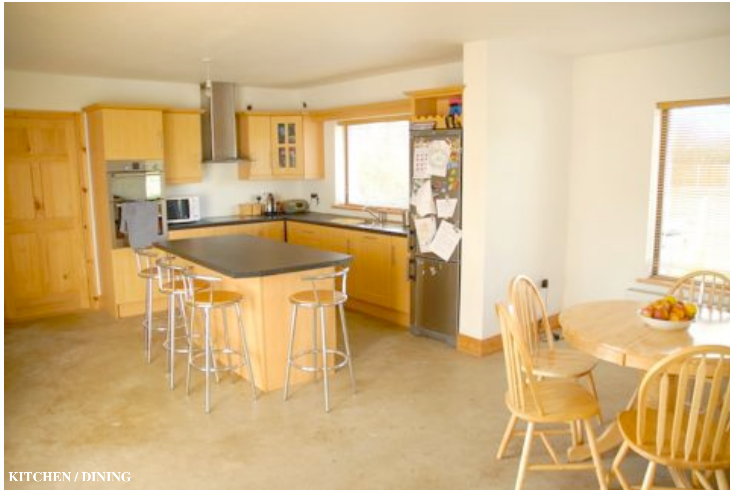
KITCHEN / DINING